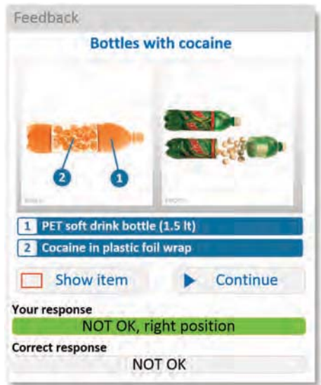
Figure 3: Display of the feedback feature on the interface of the Customs X-Ray Simulator training program

X-ray images, information from the waybill, registration documents, and customised tags can be uploaded on to the shared database. The application architecture supports fully web-based clients by using HTML5 and AngularJS. The software can be used on-premises, by installing it on a server, located on the customs administration's premises. In this case, the configuration data and the user's results are stored on a local centralised database. This option enables